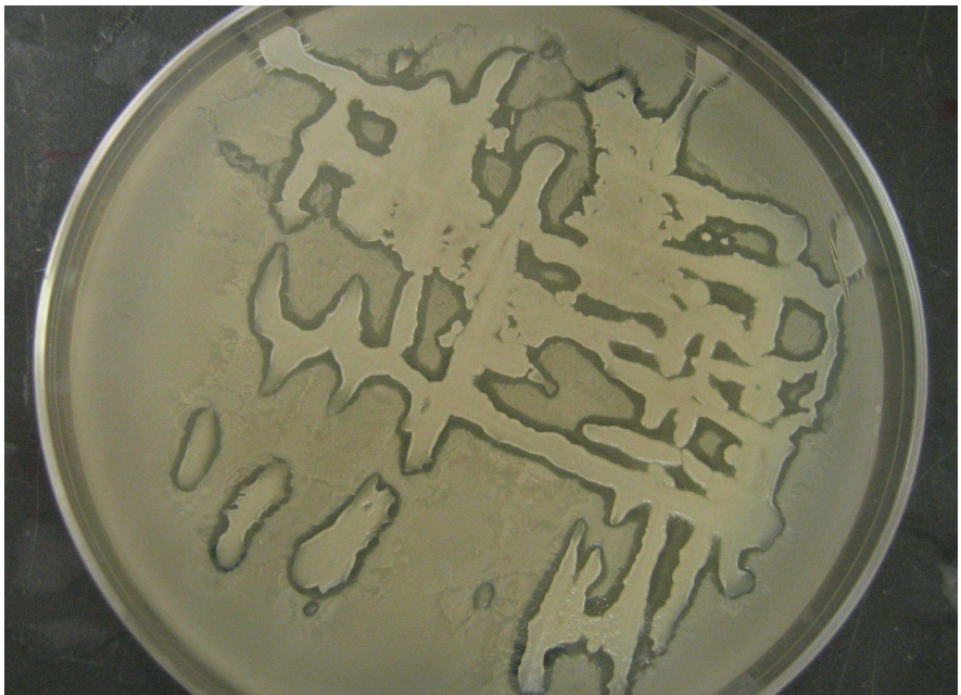
Antibiotic producing bacteria (opaque) surrounded by biofilm growth.

Figure 5. Hot water tank streak plate showing inhibition zone (clearing zone) surrounding colonies producing antibiotics.