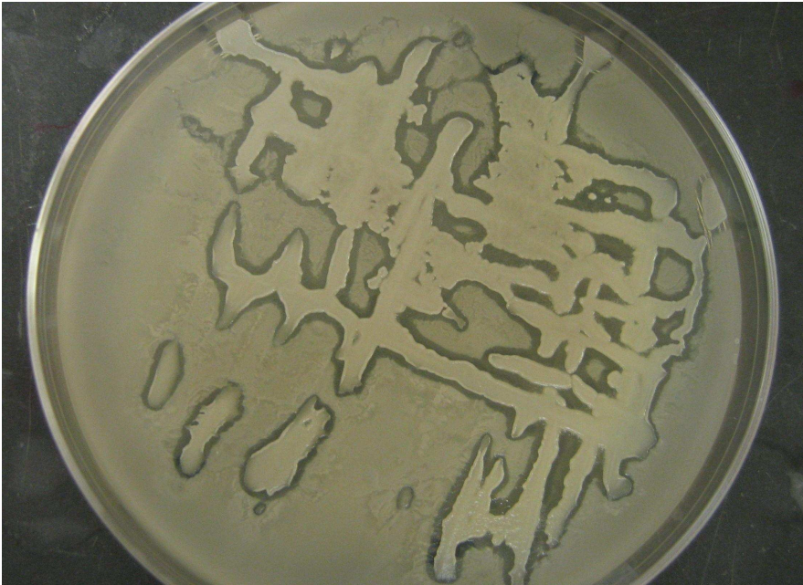
Antibiotic producing bacteria (opaque) surrounded by biofilm growth.